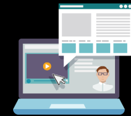
Creosouls: Online Platform to Showcase Portfolio