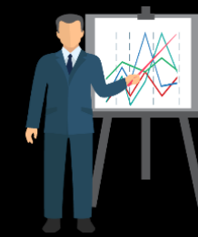
Industry Relevant Curriculum