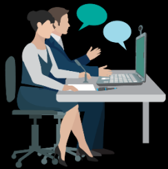
Job Oriented Program