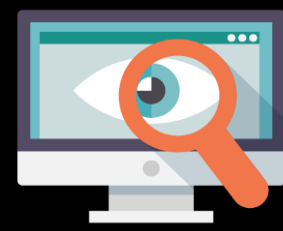
Latest Tools and Software