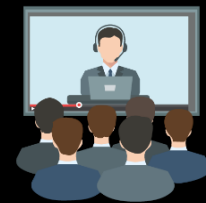
Online Varsity Exclusive E- Learning Platform