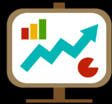
Employment Driven Education (EDE)