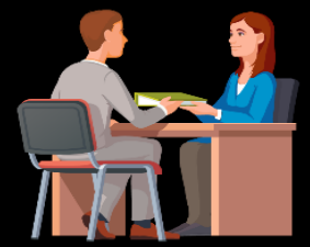
Loan Facility Available